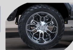
Silent Tire with Off-road Thread