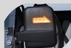
Powered Rear View Mirrors