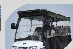
Optional All-Weather Enclosure