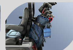
Optional Golf Bag Holder