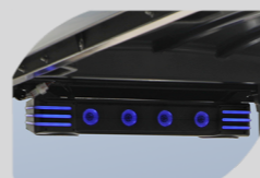
Cuboid Evolution Sound Bar