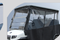
Optional All-Weather Enclosure