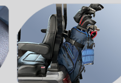
Optional Golf Bag Holder