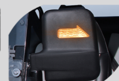
Powered Rear View Mirrors